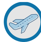
International Trade Loans