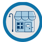
Community Advantage Loans